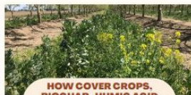
HOW COVER CROPS, BIOCHAR, HUMIC ACID AND OTHER PRACTICES IMPROVE SOIL HEALTH AND WATER QUALITY